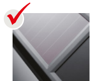
ENERGY EFFICIENCY (NZBC Clause H1)