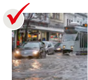
WEATHERTIGHTNESS (NZBC Clause E2)