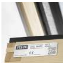
2 Data plate • window type, size and variant code • CE marking • production code • QR code