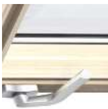
9 Bottom handle • anodised aluminium