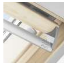
4 Control bar • anodised aluminium