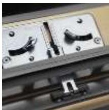
1 Lock casing • electro-galvanised steel • colour: "silver"