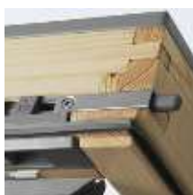
6 Barrel bolts • plastic • colour: grey • steel • colour: "silver"