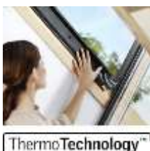
5 Excellent insulation • expanded polystyrene • colour: grey charcoal