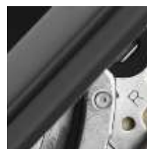
7 Hinges with friction • electro-galvanised steel • colour: "silver"