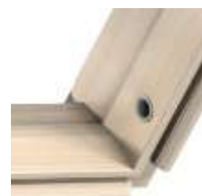
8 Barrel bolt bushings • plastic • colour: grey