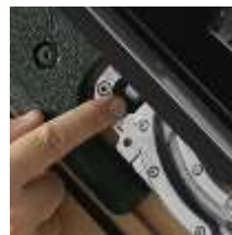
3 Click-on covers • lacquered aluminium