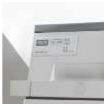
2 Data plate • window type, size and variant code • CE marking • production code • QR code