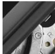
7 Hinges with friction • electro-galvanised steel • colour: "silver"