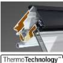
5 Excellent insulation • expanded polystyrene • colour: grey charcoal • thermally modified timber