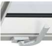
9 Bottom handle • anodised aluminium