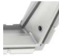
8 Barrel bolt bushings • plastic • colour: white