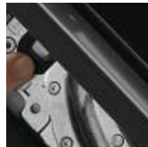
3 Click-on covers • lacquered aluminium