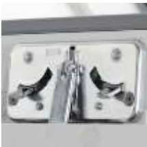
1 Lock casing • electro-galvanised steel • colour: "silver"