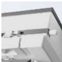
6 Barrel bolts • plastic • colour: white • steel • colour: "silver"