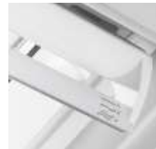
4 Control bar • anodised aluminium