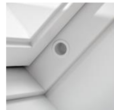
8 Barrel bolt bushings • plastic • colour: white/grey