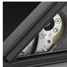
7 Hinges with friction • electro-galvanised steel • colour: "silver"