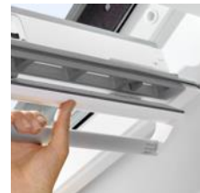
4 Control bar • anodised aluminium