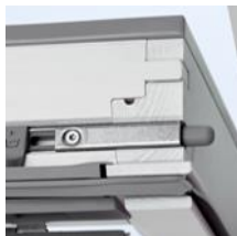
6 Barrel bolts • plastic • colour: grey • steel • colour: "silver"