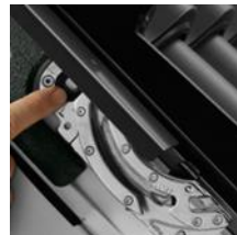
3 Click-on covers • lacquered aluminium