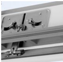
1 Lock casing • electro-galvanised steel • colour: "silver"