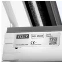
2 Data plate • window type, size and variant code • CE marking • production code • QR code