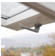
9 Bottom handle • anodised aluminium