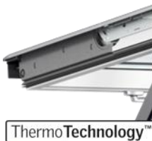
5 Excellent insulation • expanded polystyrene • colour: grey charcoal