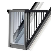
11 Railings and balusters • plastic and painted aluminium • colour: black • passivated steel hinges • colour: "silver"