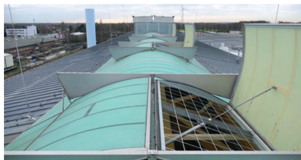
GRILLODUR® DSG in a double flap

With the appropriate certification in accordance with GS-BAU-18, the GRILLODUR® DSG fall-through protection is able to fulfil the high requirements of the employer's liability insurance association for the construction industry.