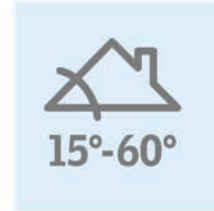
Pitched Roof Sun Tunnel