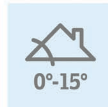
Flat Roof Sun Tunnel